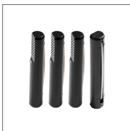
Bench dogs, round