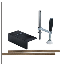
Accessory kit MFB 1060