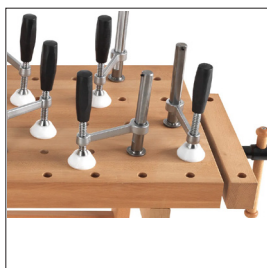
Sjöbergs MFB 1060